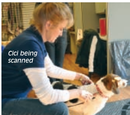
Cici being scanned

When you bring new pets into your household, please be sure to have them microchipped. It is a very simple and inexpensive process. It takes less than 10 minutes and can be done while they are being spayed or neutered. You must then register your personal information with the microchip provider so that they can include it in the national microchip database. This makes it much easier for your pet to be reunited with you should it become lost or stolen. If you move, please remember to change your contact information with your microchip database. This information can be easily maintained online. Be a responsible pet owner – it can make all the difference! •